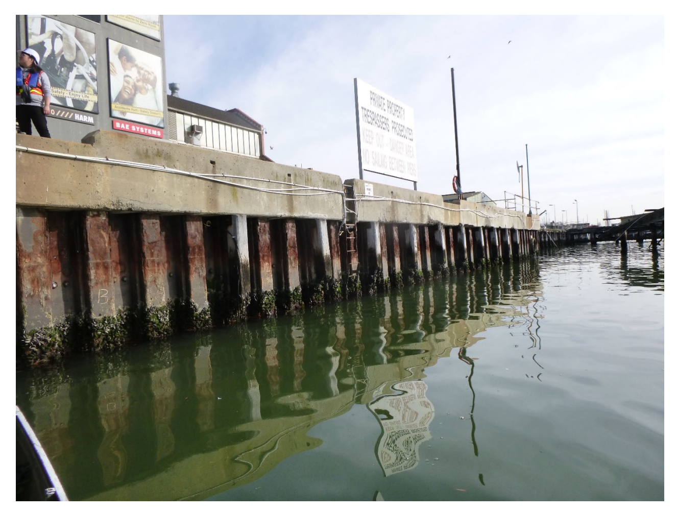
East end of Reid Pier at Williamstown, Victoria. Testing in 2018.