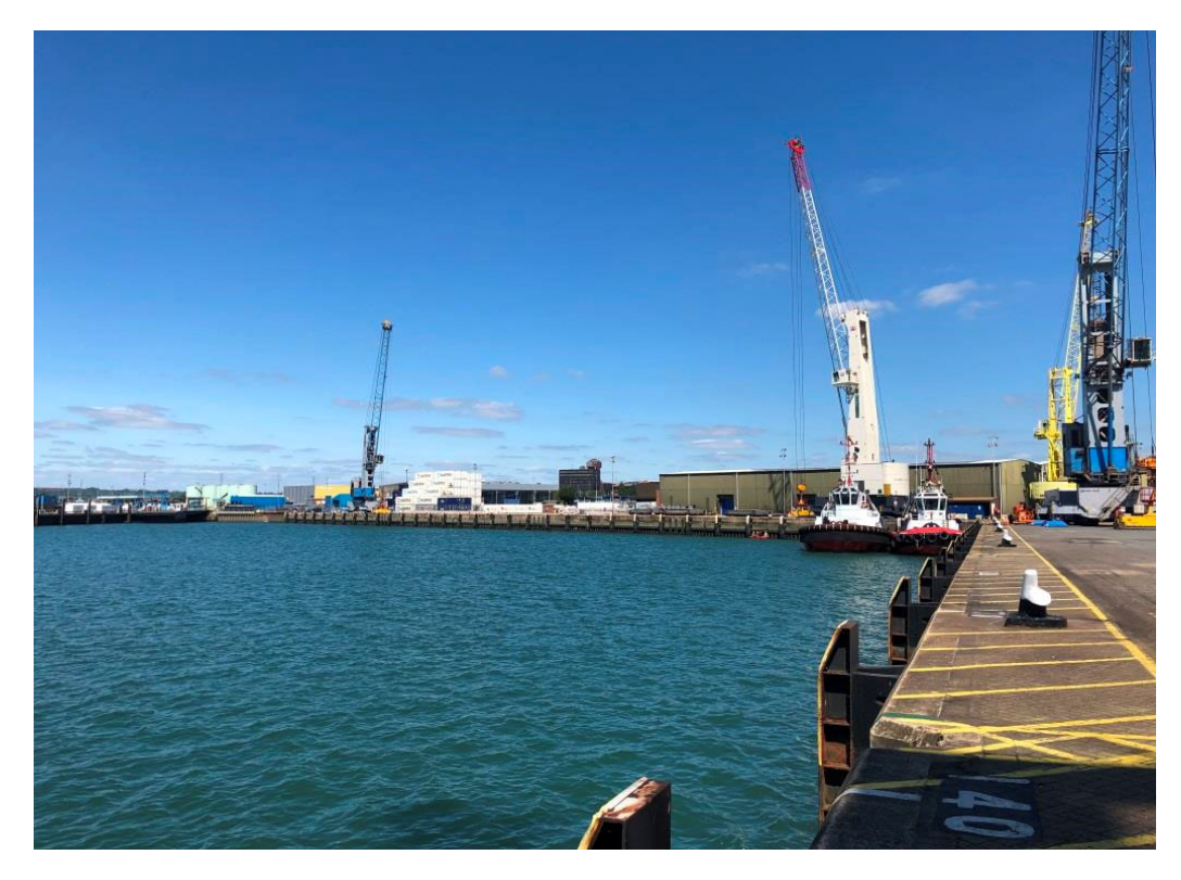
AJQ wharf for Portsmouth City Council. 2019